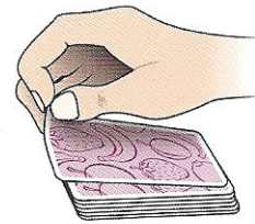
Turning over a card.

When turning over a card, players should turn the card over away from them to ensure that they do not see the card before the other players. The faster they turn over the card, the sooner they will see it.